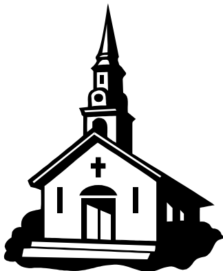
Local Church News

NORFOLK, FBC: An AWANA Grand Prix was held on Nov. 23 at FBC. The Wayne FBC hosted the Norfolk FBC at a bowling party in Norfolk on Nov. 10. A tubing tobogganing day at Mahoney State Park was planned (depending on weather) by the Youth Group.