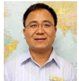
Mang Sonna Bethel Neighborhood Center Kansas City

Cost: You must Make reservations with the church to attend the Saturday night meal. $10 per person. 402-371-5609