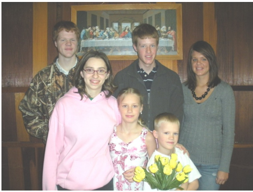
Some of the youth at Riverside Baptist Church joined in the celebration of the church's 135 Anniversary on March 7.

MOTHERS DAY is May 9. Can you identify the children of these Bible mothers?