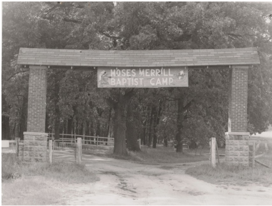
Entrance to Moses Merrill Baptist Camp at Fullerton . . . The ABC/NE home-place from the mid-1940s to the early 1970s.

If this is what you think of when you hear "Camp Merrill," you need to come see us this year!!