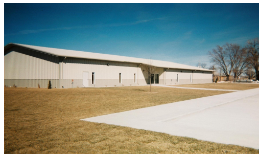
First Baptist Church of Arnold